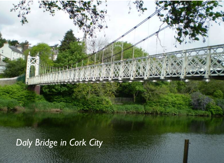
Daly Bridge in Cork City

Further information is also available on our project website at www.leecframs.ie