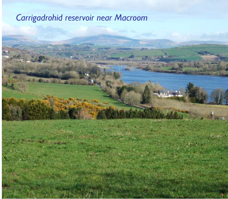
Carrigadrohid reservoir near Macroom