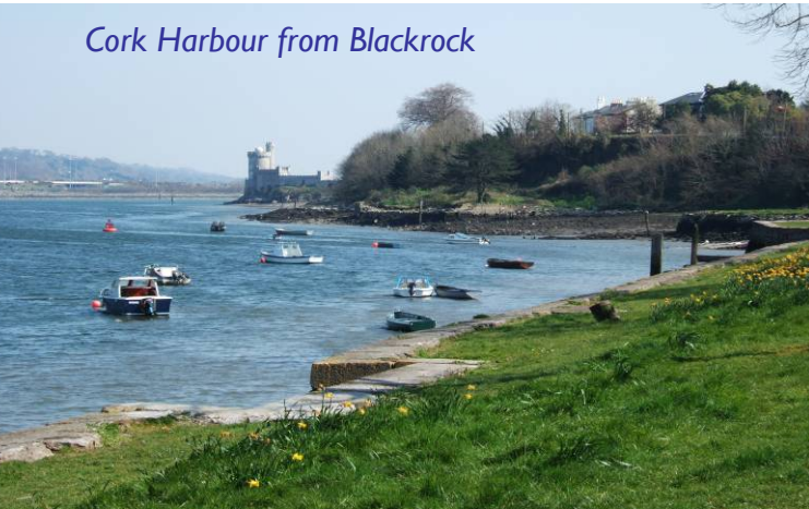
Cork Harbour from Blackrock

Further information is also available on our project website at www.leecframs.ie