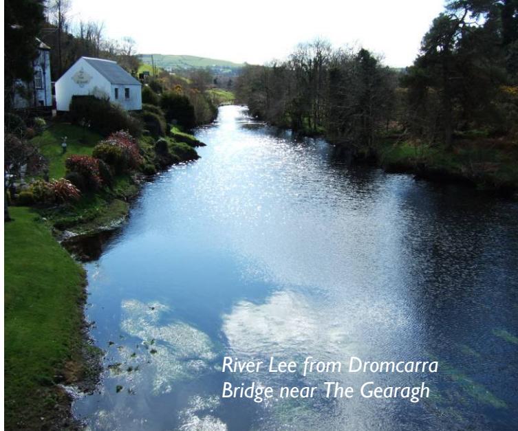
River Lee from Dromcarra Bridge near The Gearagh

The next issue of the newsletter will be available at the end of June.