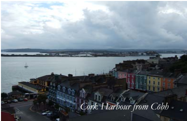
Cork Harbour from Cobb

Welcome to the second edition of the Lee CFRAMS monthly newsletter. In this edition we will outline all the key stages of the project and provide details of upcoming public information and consultation days. In future editions of the newsletter we will focus on different areas of the study and provide up to date information as the study progresses.